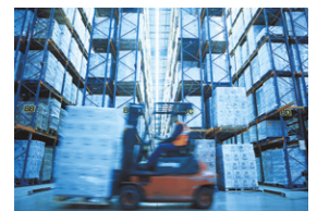
Product Recall Insurance