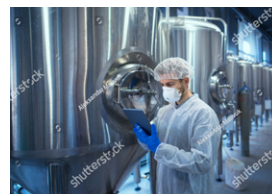
Contaminated Product Insurance

We pride ourselves on building long-term client relationships by providing comprehensive value, quick turnaround times and excellent service to our global client base that spans multinational manufacturers, distributors, assemblers, and wholesalers involved in the supply chain. AIG Talbot brings in-depth insights and leverages our experience across a wide range of industries, including: