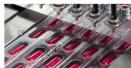
Topical & Consumer Health