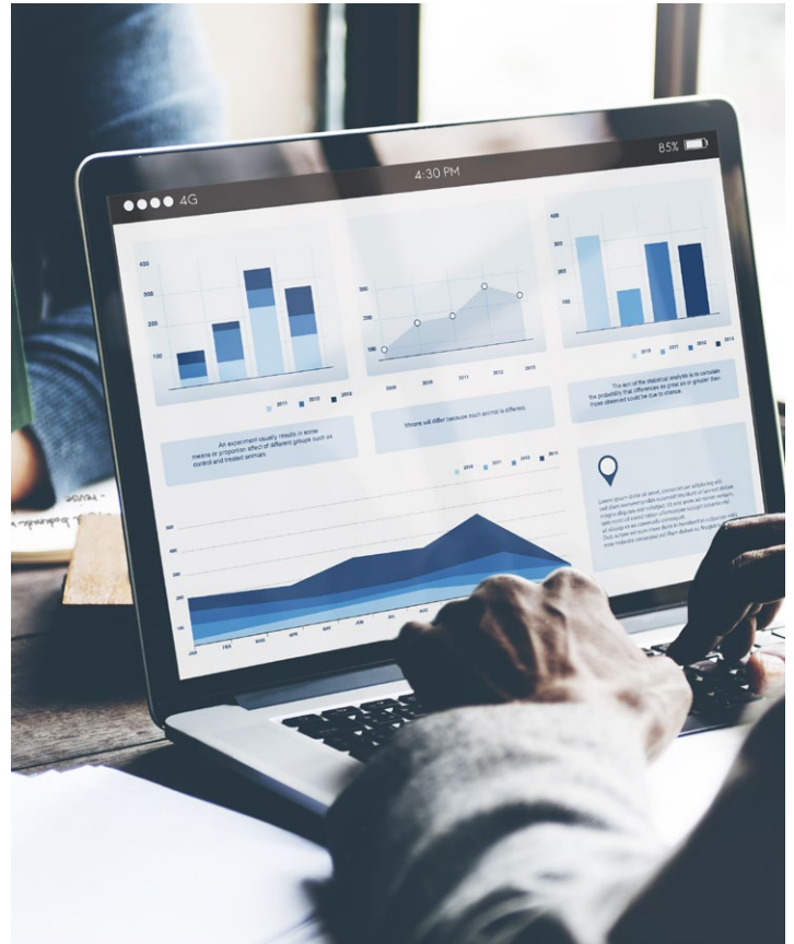
Figure 2. Common Allegations Cited in Excessive Fee Cases

But in recent years, plaintiff's lawyers appear to be exploiting ERISA to take aim at plan fiduciaries and sponsors. Excessive fee class action claims, as the name suggests, generally allege that fiduciaries of defined contribution plans (and occasionally defined benefit plans) subject to ERISA breached their fiduciary duties by (1) failing to adequately negotiate and/or monitor the fees charged by plan service providers (fund managers, administrators and record-keepers, etc.) and/or (2) selecting imprudent investment options for plan participants and/or failing to monitor performance and reassess those options consistent with their fiduciary obligations under ERISA. Below, in Figure 2, we categorize several other common allegations facing plan fiduciaries: